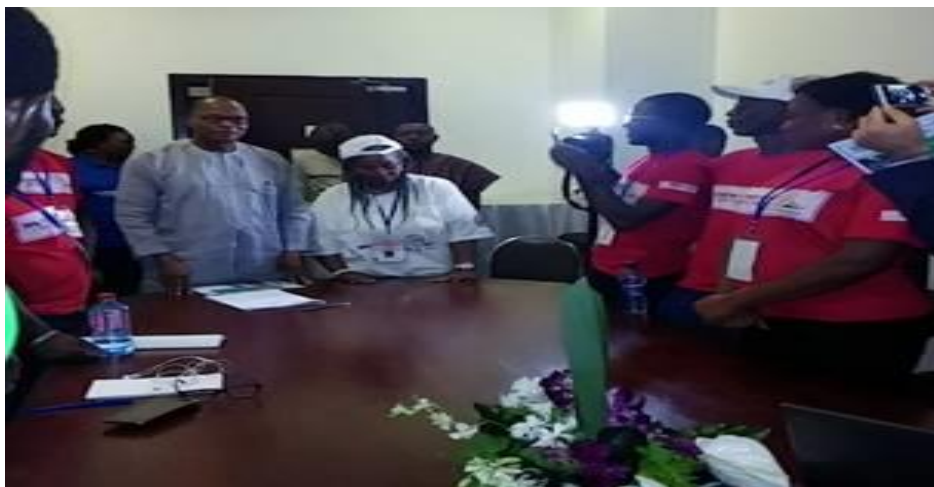
Dr. Chambas paid a courtesy call to engage with the Youth in Ghana

UNOWAS, under the leadership of H.E. Dr. Ibn Chambas continues to be one of the major sponsors of the ECOWAS Youth solidarity Mission for the WSR. Dr. Chambas also continues to grace the Youth Room with his presence to engage with the gangs in countries where the WSR has been replicated.