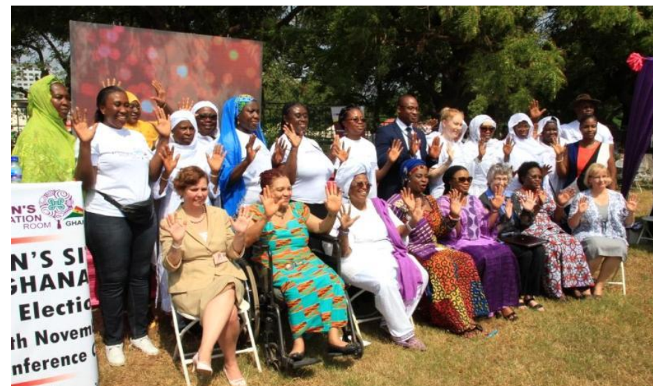
The women leaders of the WSR Ghana

The WSR rallies women, youth, religious and traditional leaders and institutions, media, and development partners to ensure a peaceful electoral process which empowers women to exercise their civil rights and influence the pathways of their nations. Some 10,000 people joined the march for peace, from women’s group, youth organization, and women leader of the various political parties across all 10 regions of the country. The success of the WSR as a powerful peacebuilding platform led to its adoption by women leaders and elders in Ghana.