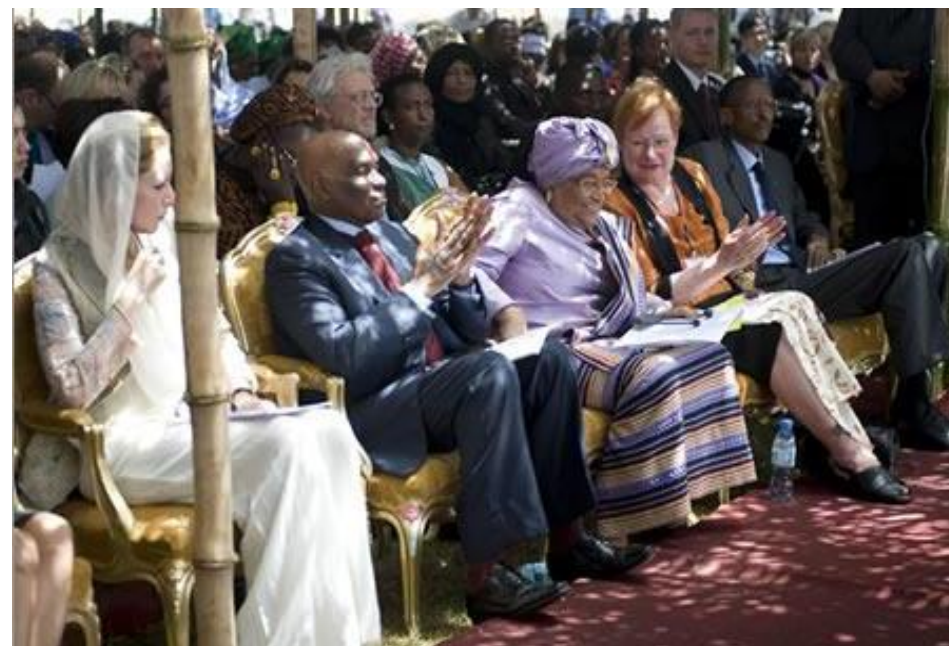
Co-conveners President Sirleaf Johnson and President Tarja Halonen of Finland, with Ms. Gadhaifi, President Adoul Wade of Senegal and President Paul Kagame of Rwanda

ABIC responds to UN Security Council Resolution 1325 on the subject of Women's Involvement in the promotion of peace and security, throughout the African Continent under the Centre's Flagship product the innovative Women's Situation Room (WSR) which has received accolades from all quarters, including the UN Security Council and the African Union, amongst others. President Ellen Johnson Sirleaf is the Champion of the Room